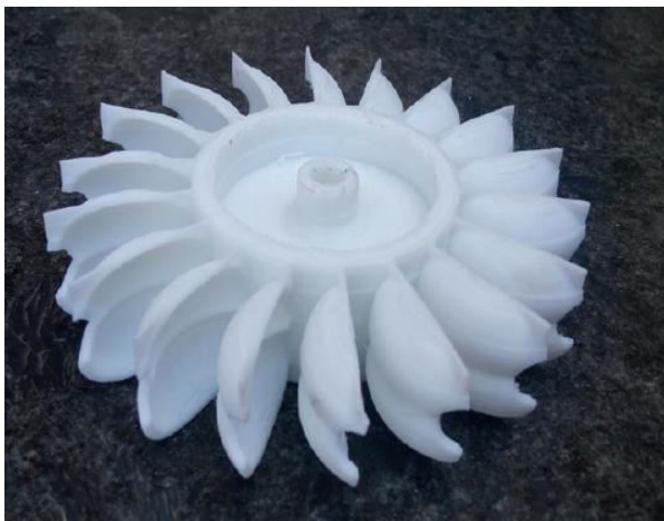
FIG : Actual turbine model